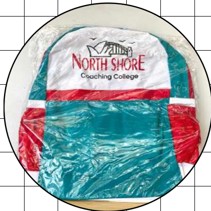
North Shore Bag