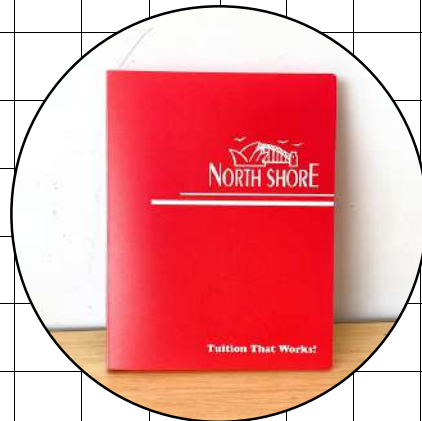
North Shore Red Folder